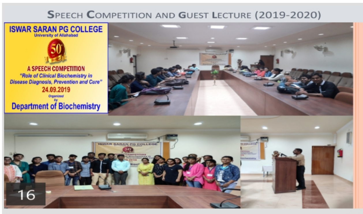
Department of Bio-Chemistry: Guest/Special Lecture and Speech Competition on 24.09.2019