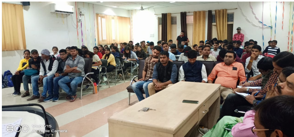
Department of Political Science: A Model Workshop on Human Rights Awareness Program on 3_12_2019