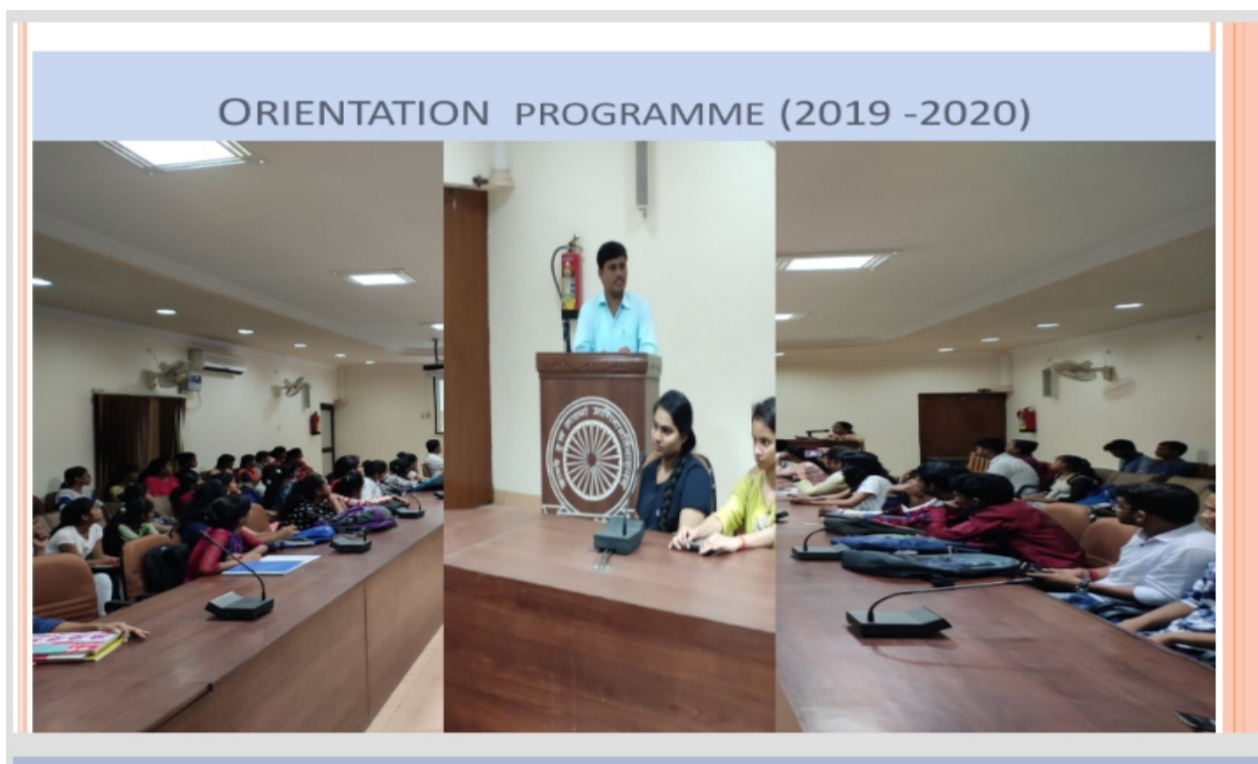
Department of Bio-Chemistry: Orientation Program