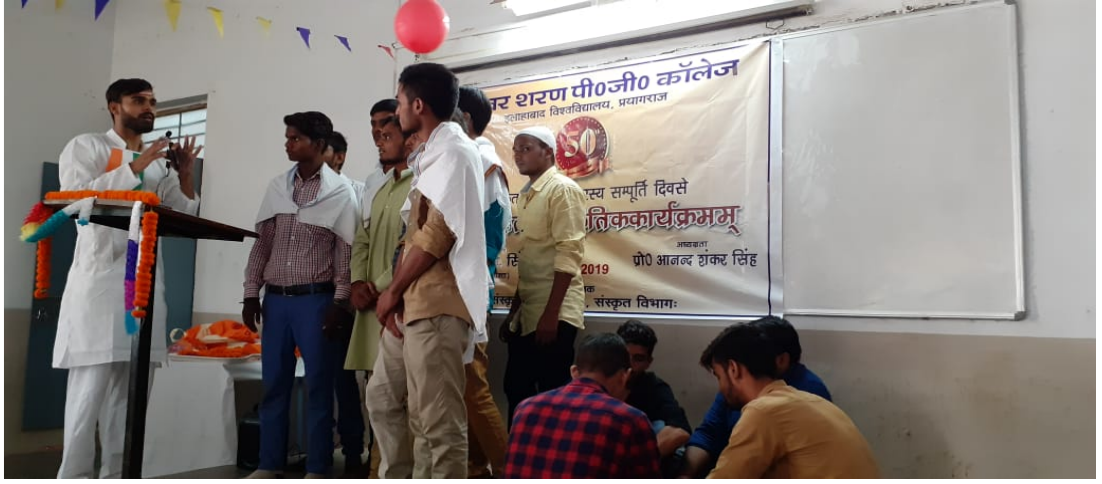
Department of Sanskrit: संस्कृत दिवस समारोह के अवसर पर छात्रों द्वारा लघु नाटिका का मंचन।