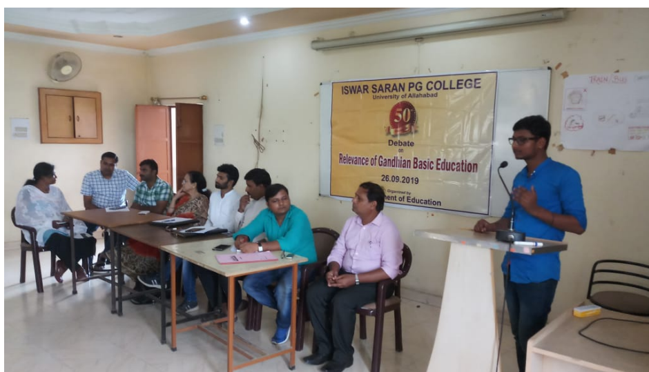
Department of Education: Debate competition on the Topic "Relevance of Gandhian Basic Education" on 26. 9.2019