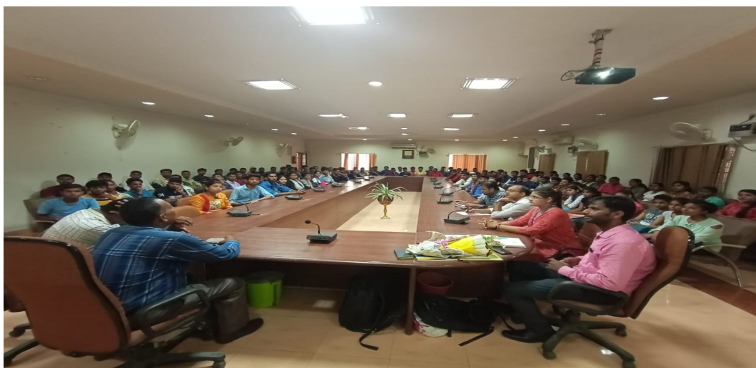
Department of Computer Science: ICT Training non teaching staff and Student by NIIT on 20.09.2019