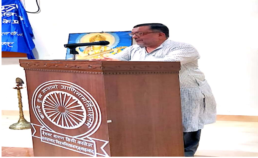
Department of Hindi: Hindi pakhware ke antargat “Hindi Lokrang manch ka Saundaryashastra” 06_09_2019