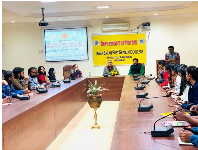
विभाग: मध्य.व आधु. इतिहास: विशिष्ट व्याख्यान माला। विषय: भारतीय विरासत और संस्कृति: चुनौतियां एवं निरंतरता। दिनांक: 20.02.2020 गुरुवार।