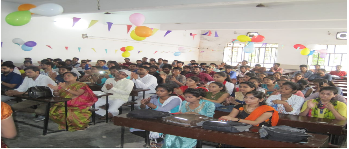
संस्कृत दिवस समारोह