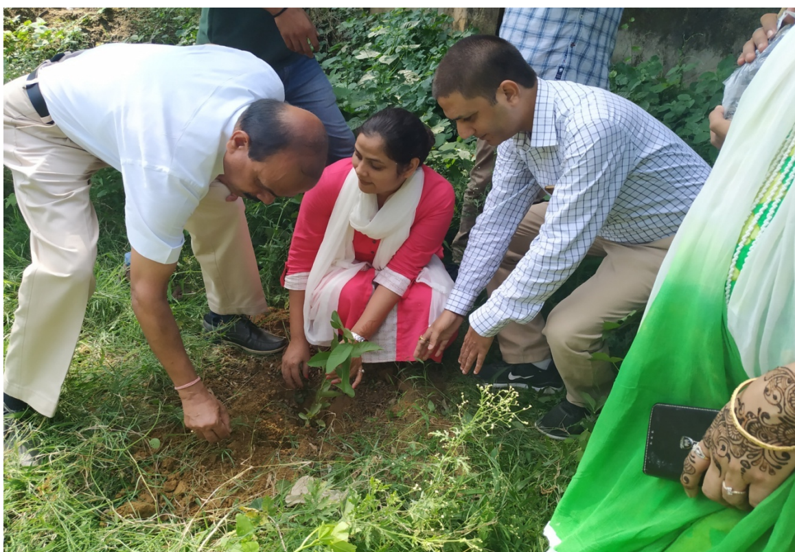
Department of Economics: Plantation Drive on 08.09.2019