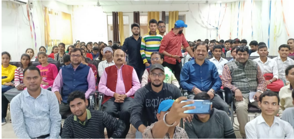
Department of Political Science: A Model Workshop on Human Rights Awareness (03_12_2019)