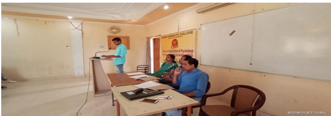
स्वर्ण जयंती वर्ष के उपलक्ष्य में मनोविज्ञान विभाग में “मनोविज्ञान और सम्भावनायें: दैनिक जीवन से लेकर वैश्विक राजनीति तक” 27.11.2019