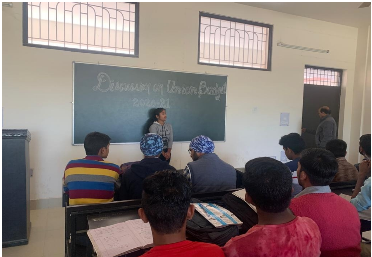
Department of Economics: Discussion on Union Budget: 2020-21 on 03.02.2020