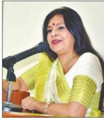
ईश्वर शरण डिग्री कॉलेज में लोकभाषा और हिंदी पर आयोजित व्याख्यान में बोलती पद्मश्री मालिनी अवस्थी।

कहा कि हिंदी फिल्मों ने कश्मीर से कन्याकुमारी तक अपनी सांगीतिक भाषा के माध्यम से सबको बांध रखा है। उन्होंने हिंदी फिल्म कलाकारों की ओर संकेत करते हुए कहा कि कलाकारों से ज्यादा पारखी किसी और की नजर हो ही नहीं सकती। हिंदी वैज्ञानिक भाषा है, जो जन-जन में बड़ी आसानी से संप्रेषित हो जाती है।