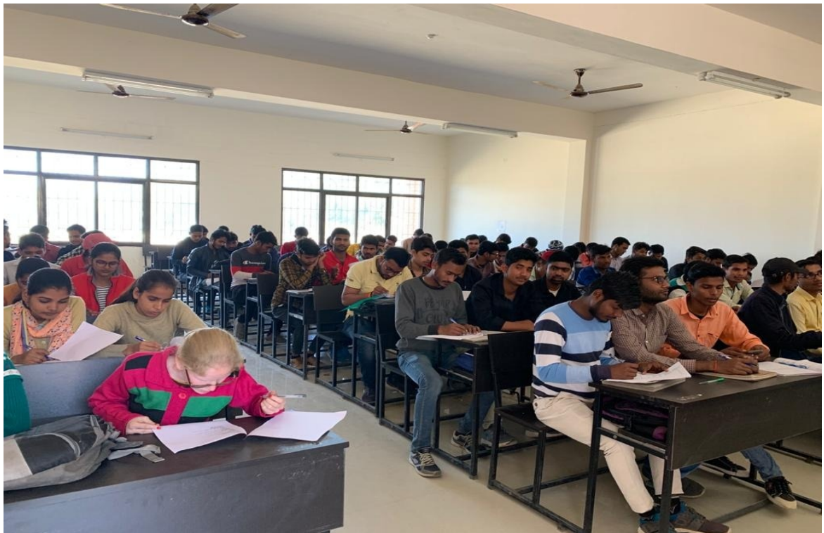
Department of Economics: Quiz Competition on 13.11.2019